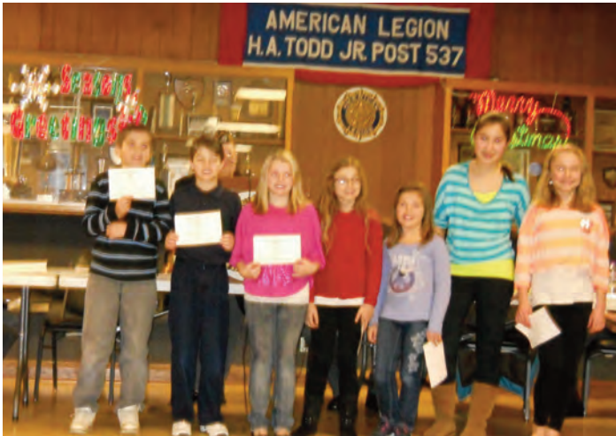
Students from St. Matthias Parish School, who won the Post Coloring Contest.