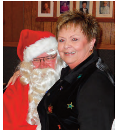
correction from last month